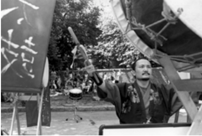
ParkArts performance in Titus Sparrow Park