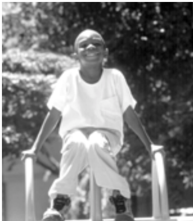
Titus Sparrow Park

Herald Streets). The plan's guidelines for Parcel 21 call for "[i]nclud[ing] a mix of active recreation facilities, a paved area ... to accommodate community gatherings and festivals, and quieter seating areas." (Section IV, Implementation, page 81.) The remainder of the site would be developed with a building at or over 150 feet in height for mixed-income housing and commercial or community uses. With active recreation field sports requiring from 3/4-acre for football to 1.2-acre minimum for Little League (soccer would need an acre), and given the other requirements for other uses such as paved areas, quiet seating areas, and such, the type of active recreation facility appropriate for this site from a size point of view would be courts for basketball, tennis, handball, volleyball, street hockey, and the like. A process that reviews the needs of the Quincy School across the street and of the South End and Chinatown communities will help align this site's potential with its constraints. The plan's approximately 1.5-acre Parcel 18 park would better accommodate field sports facilities from a size point of view. The configuration of the park as shown in the plan, however, may limit the type and size of field, if a field is desired there. Again a review of community needs will help the city develop appropriate uses for this site.