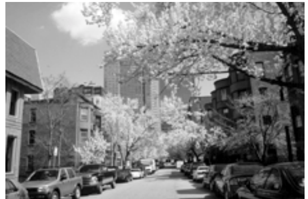
St. Botolph Street, South End

Much has been accomplished over the past seven years for this neighborhood's street and park trees. New park trees have been planted through a Department program where persons or other entities can donate funds for a tree with a plaque placed in the soil. The minimum donation also includes two years of follow-up care. Friends groups have also contributed to tree planting and care. The Department has eliminated the backlog of dead, dying, and diseased street trees needing removal. Many of the tree pits have been replanted with a mix of species to prevent large-scale losses from disease. The goal for tree care in this neighborhood in the future will be to assure adequate funding for park and street tree maintenance as many of the newer trees get older and already aging and stressed trees call for more frequent care.