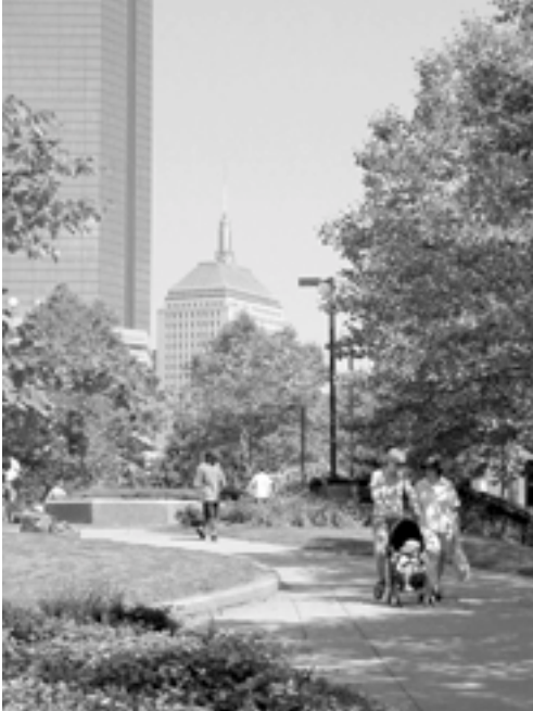
Southwest Corridor Park

cooperation with the Blackstone/Franklin Square Association, the Chester Park Neighborhood Association, and other neighborhood groups.