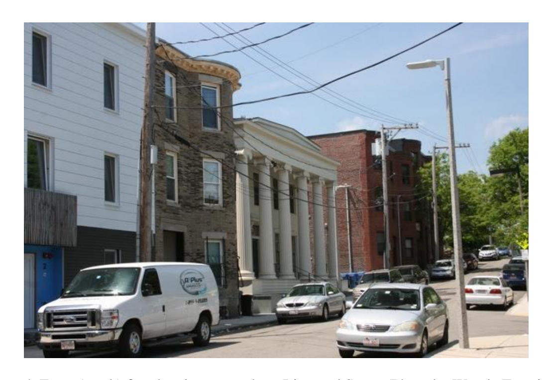
4. Front (north) façade, view west along Linwood Street (Photo by Wendy Frontiero, 2015).

3. West and south façades (Photo by Greg Premru, 2014).