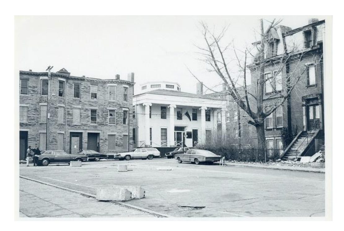
12. Front (north) façade, ca. 1960s, view south from Alvah Kittredge Park.