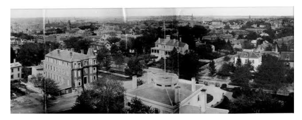
10. View to northeast, 1880s. Kittredge House roof at lower center.