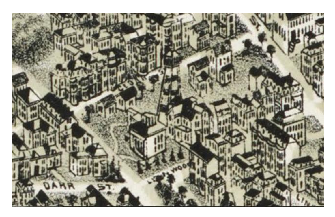
8. Bird's eye view of Roxbury, looking southwest, 1888. Alvah Kittredge House with Bradlee's observatory tower in center.