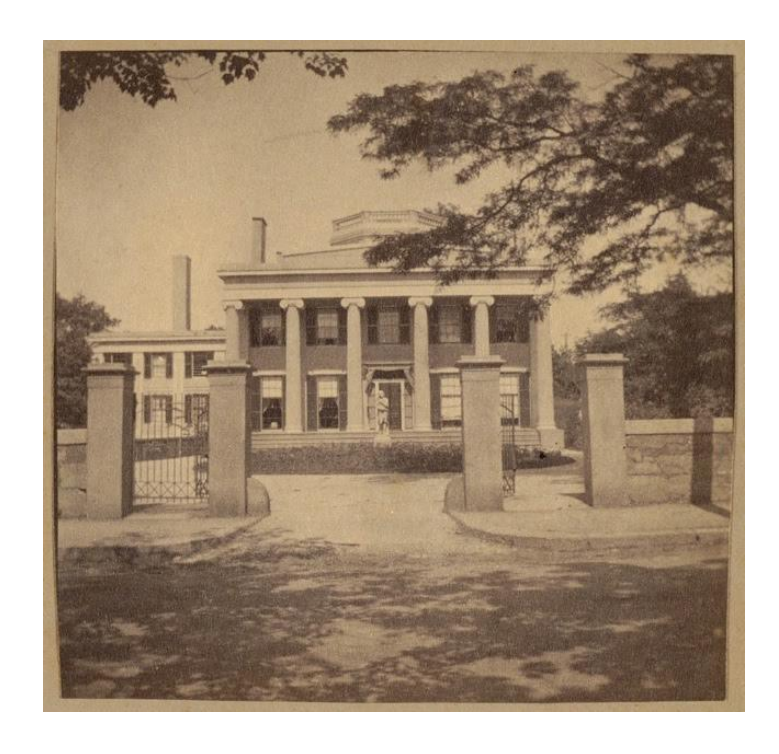
11. Front (then east) façade, ca. 1895-97, view from Highland Street.