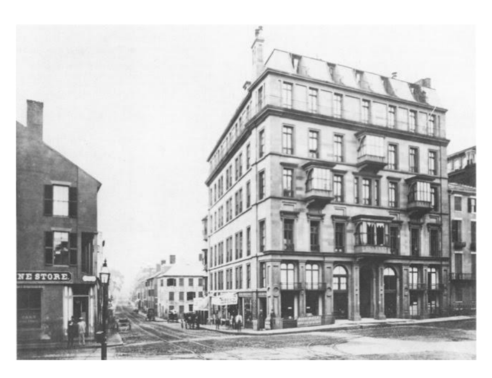
6. Hotel Pelham, corner of Boylston and Washington streets (Photo by Alfred Stone, courtesy of Bostonian Society).

5. Boston Young Men's Christian Union building, 1874 (Photo courtesy of Boston Business Journal).