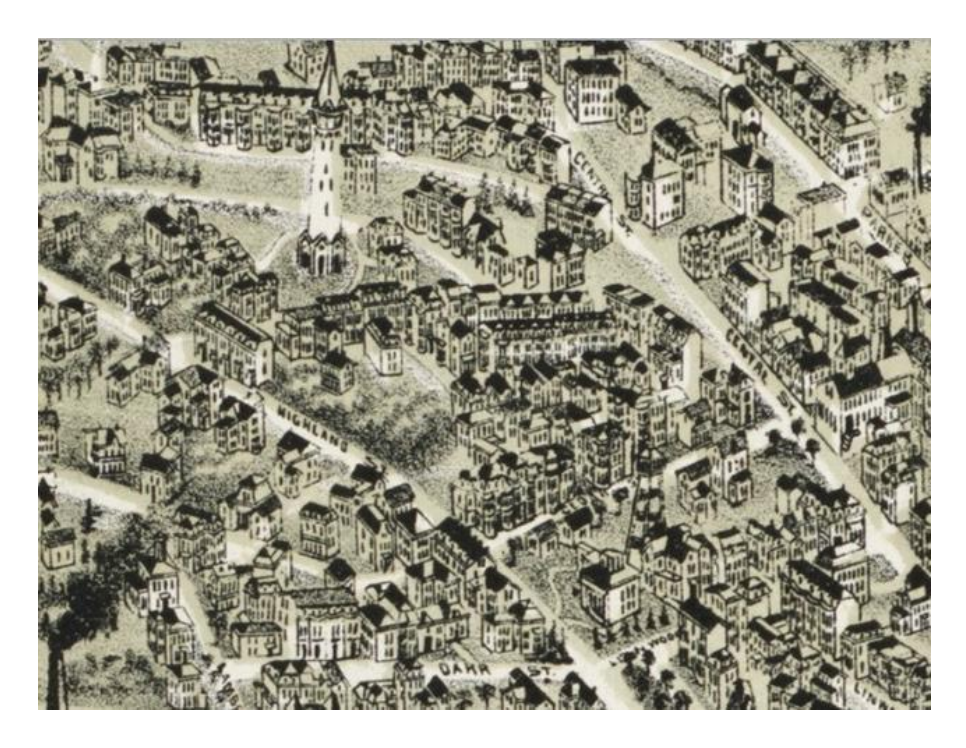
7. Bird's eye view of Roxbury Highlands, looking southwest, 1888. Cochituate Standpipe at upper left; Alvah Kittredge House at lower right.