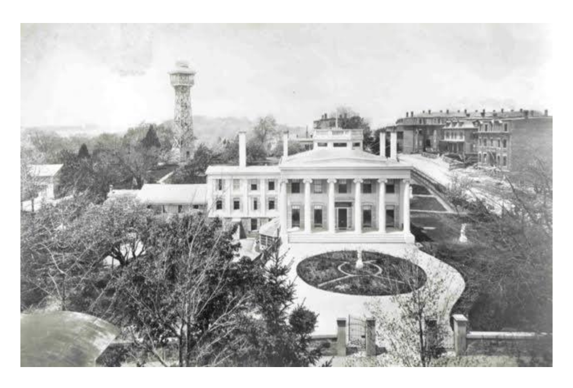
9. Kittredge House property, view to west, 1880s. Bradlee's observatory tower at upper left; Linwood Street on right.