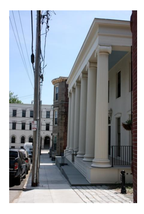
5. Front (north) façade, view east towards Highland Street (Photo by Wendy Frontiero, 2015).