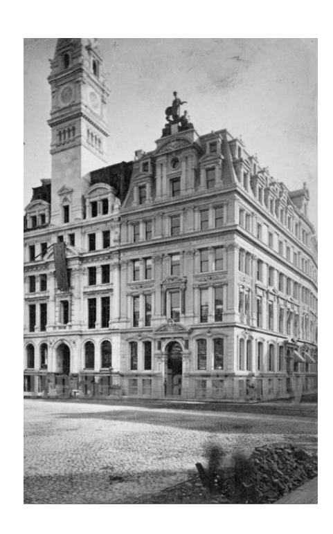
4. New England Mutual Life Insurance Co. Bldg, 1874, on right. Peabody & Stearns' New York Mutual Life Insurance Co. Bldg (1874-75) on left.