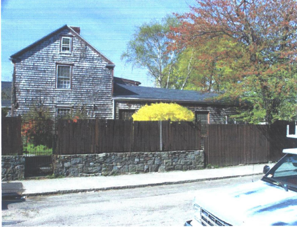
Hosmer Street elevation of house showing one story rear addition.