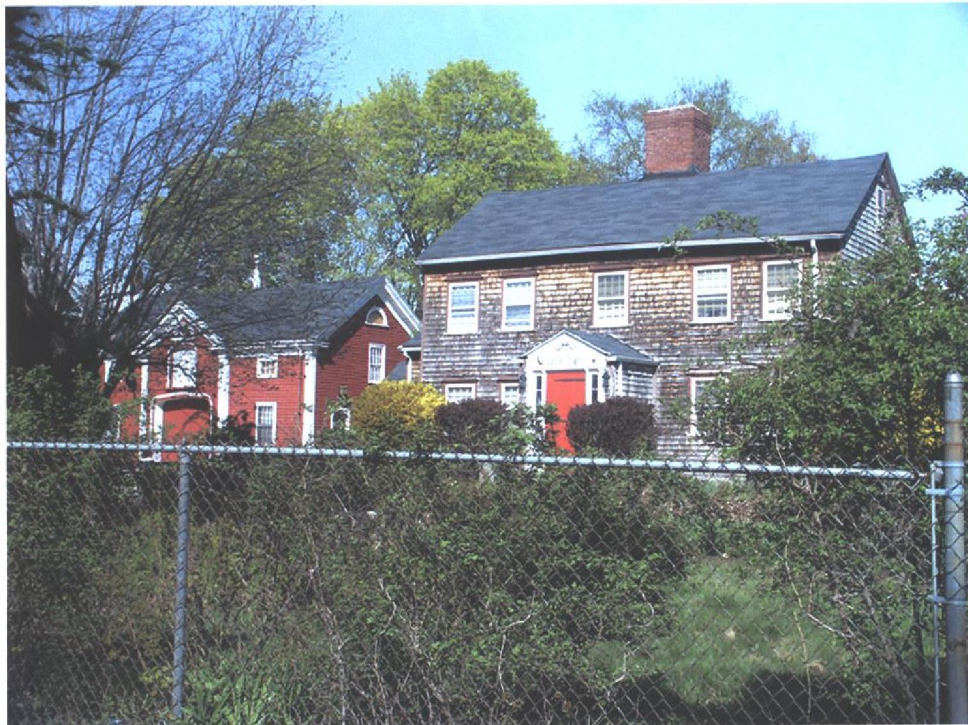
Close-up view of house and stable from southwest corner of Norfolk and Hosmer Street.