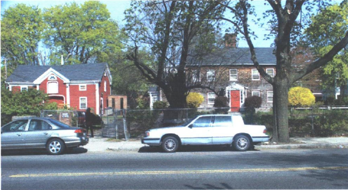
House and stable from Norfolk Street.