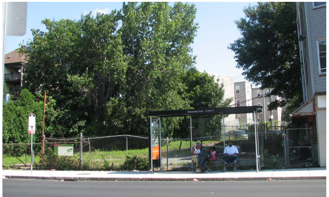
Existing vacant site at 334-336 Washington Street

Respondents to this RFP are encouraged to submit proposals that best respond to the Goals and Guidelines stated within this document. It is expected that respondents shall review all applicable zoning and seek approval for any deviations from the code through the Board of Appeal and/or the Boston Zoning Commission.