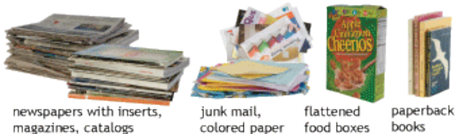
newspapers with inserts, magazines, catalogs

Beginning July 1, 2009, mix all of these materials together in your recycling cart or container. Leaving plastic windows, staples, paper clips, and spirals in paper is ok. Remember to rinse out cans, bottles, and jars. Leaving labels and lids on is ok.