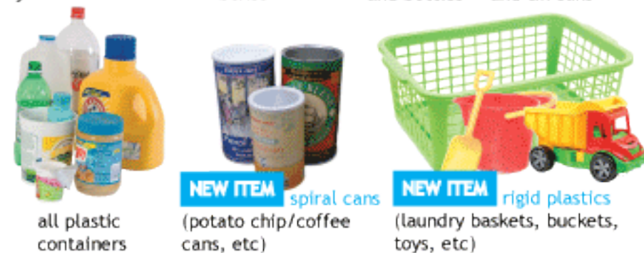
all plastic containers