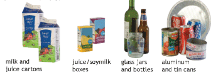
milk and juice cartons