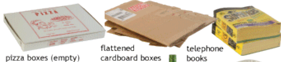
pizza boxes (empty)