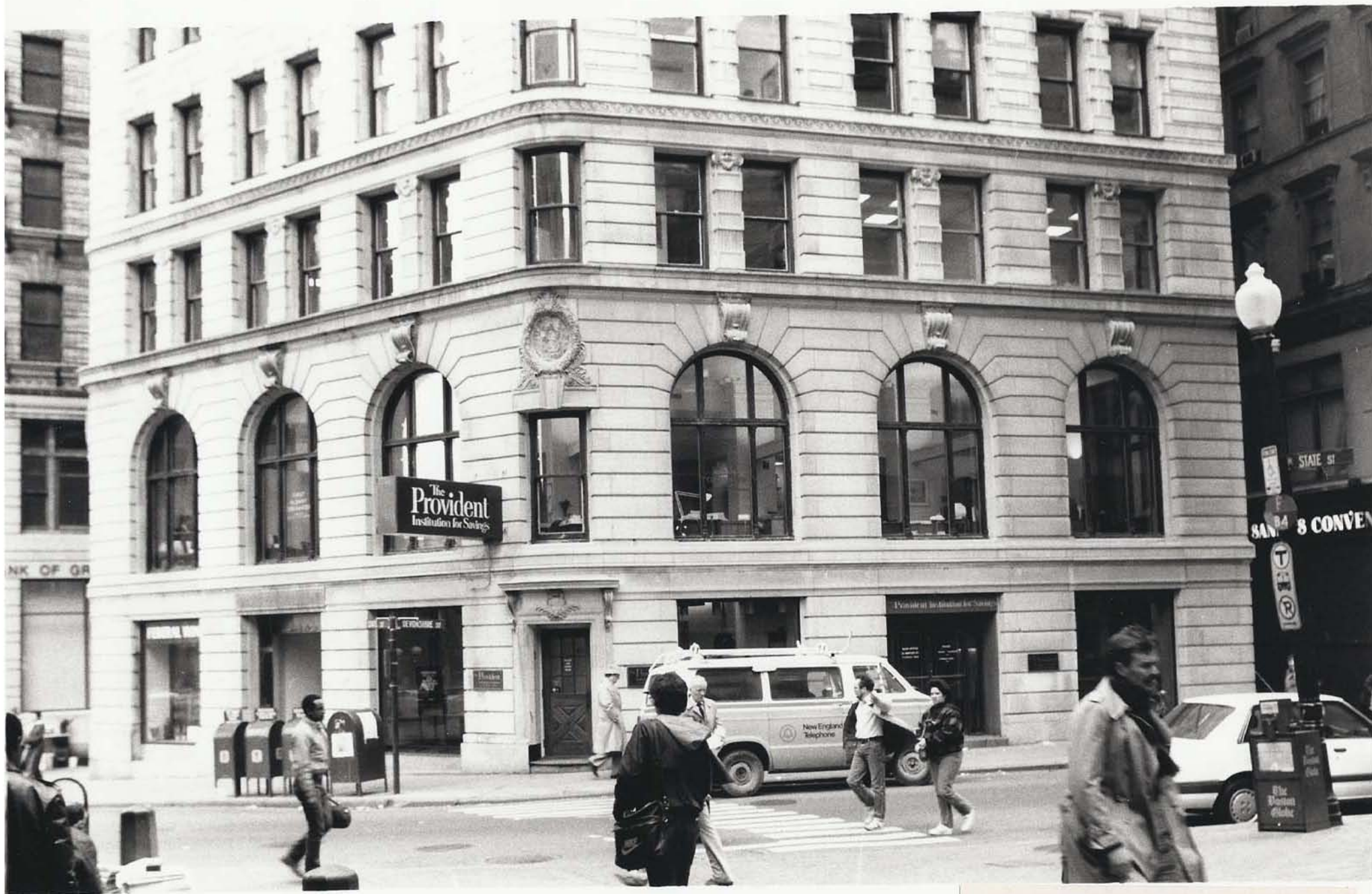
Second Brazer Building, State and Devonshire Streets.