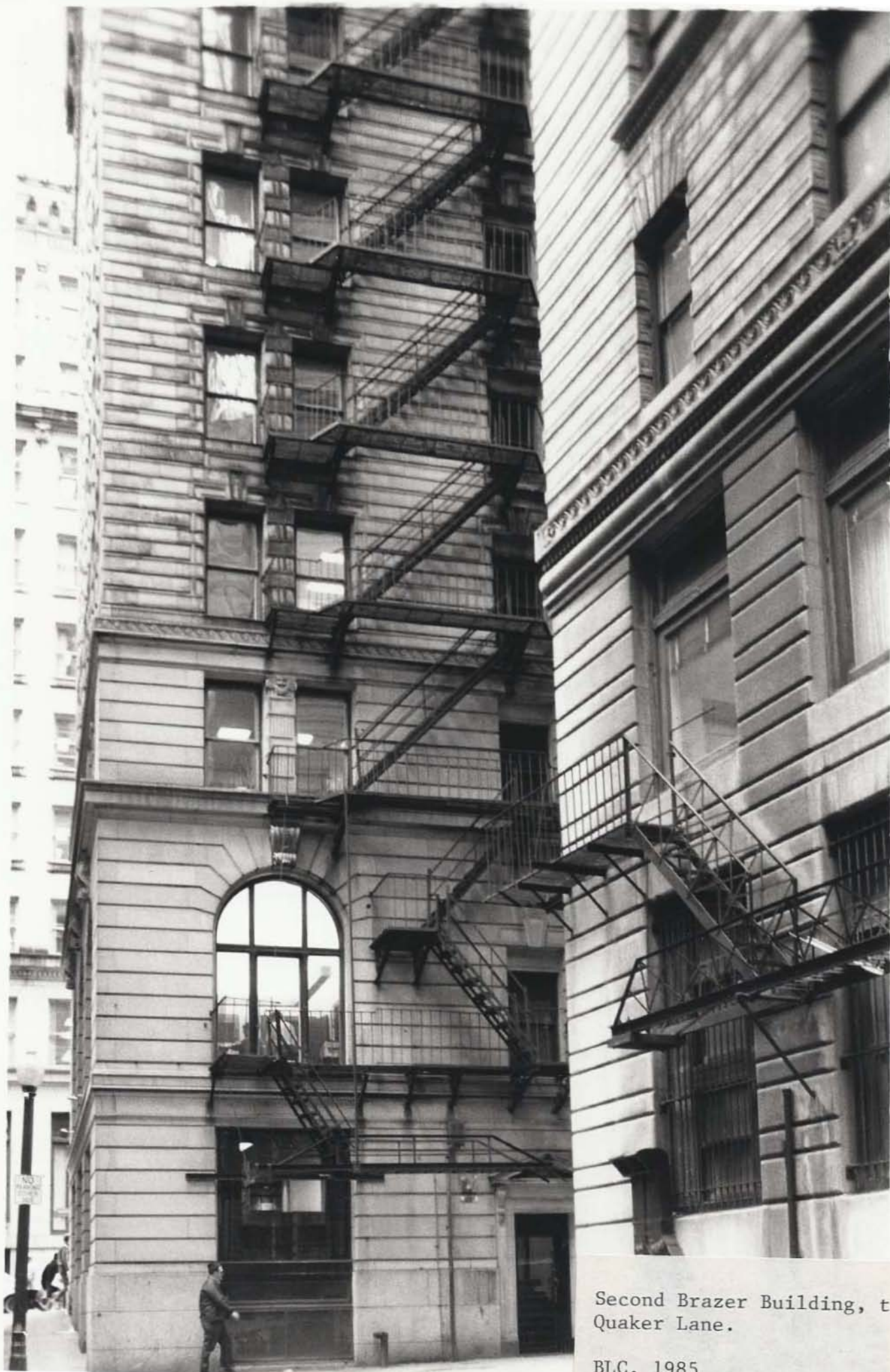
Second Brazer Building, to left, Quaker Lane.